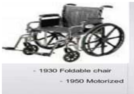
Fig 1 : Different wheelchair

The earliest records of wheeled furniture was an inscription found on a stone slate in China and a child's bed depicted in a frieze on a Greek vase, both dating back to the 6th century. The first records of wheeled seats being used for transporting the disabled date to three centuries later in China; the Chinese used their invented wheelbarrow to move people as well as heavy objects. A distinction between the two functions was not made for another several hundred years until when images of wheeled chairs made specifically to carry people begin to occur in Chinese art. There were many attempts to connect furniture to wheels dating back to the time of Christ. But perhaps the first wheelchair was invented for King Phillip II of Spain. In 1665 one of the first self-propelled vehicles was invented by Stephan Farfler.