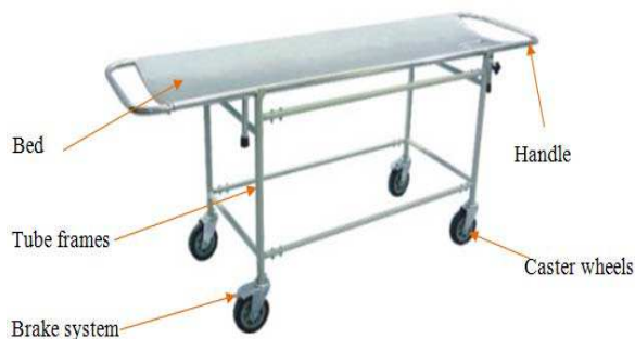
Fig 2 : Stretcher

A stretcher is a medical device to carry patients for a short duration of time. A stretcher contains a surface which supports for carrying patients, and has handles on either side along its length to help carry it.